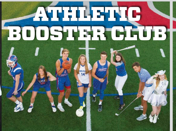
TCA funds raised through North Texas Giving Day (last six years)

“Over the last five years, funding has increased by 41% on North Texas Giving Day. I am so humbled and grateful by the continued generosity of our TCA family and friends.”